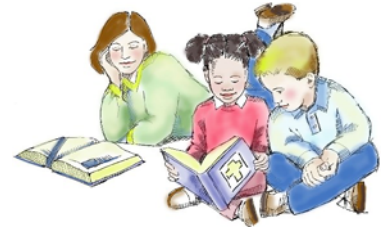
Sue Lane Librarian

Our library contains more than 1400 items including books, magazines, videos (VHS and DVD), and CD's, for children, youth and adults. Whether you seek materials for pleasure, or for finding meaning and answers to profound questions of existence, the library can be your resource.